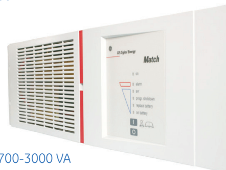
Match 19" 700-3000 VA